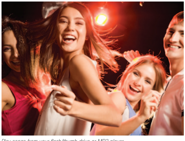
Play songs from your flash/thumb drive or MP3 player.