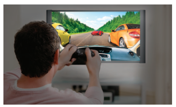
Play larger-than-life video games with vibrant color graphics. Just connect your Nintendo® Wii™, Microsoft® Xbox 360® or Sony® PS3.