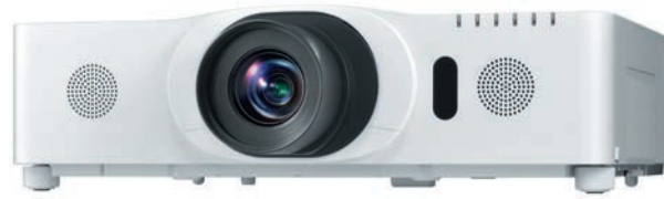
Front 3/4 View

compatible. Plus, embedded networking gives you the ability to manage and control multiple projectors over your LAN (scheduling of events, centralized reporting, image transfer, and e-mail alerts). Even with the array of advanced features, Hitachi's CP-X8170 is designed for user-friendly operation and installation convenience.