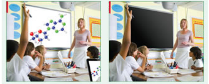
Eco AV mute off 100% power consumption

Stay in control of your presentation with the Eco AV mute feature. Direct your audience's attention away from the screen by blanking the image when no longer needed. This also instantly reduces the power consumption to 30%, further prolonging the life of your lamp