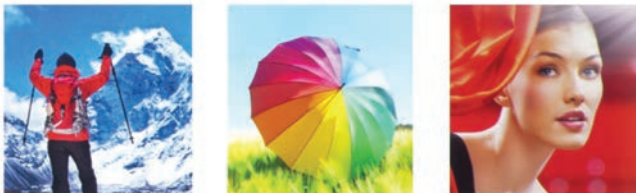
High color brightness and high white brightness