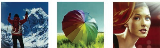
Color brightness significantly lower than white brightness

Actual photographs of projected images from an identical signal source. Price, resolution and white brightness are similar for both projectors (Epson 3LCD and 1-chip DLP competitor). Both projectors are set to their brightest mode.