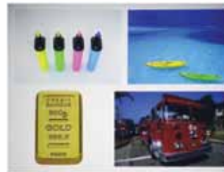
High color light output