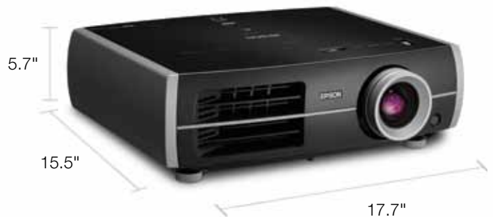
▲ Built for flexible installation

Actual photographs of images taken from two competing projectors run in default mode. Price, resolution and brightness (white light output) are the same for both projectors.