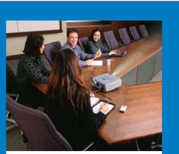
Redefine your meeting room projection.

The LP540 incorporates years of user-focused research and includes the features most requested by IT professionals across the globe. All so you can project your best—with ultimate confidence and ease.