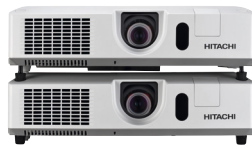
Stackable (projectors sold separately)