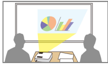
Without horizontal image correction