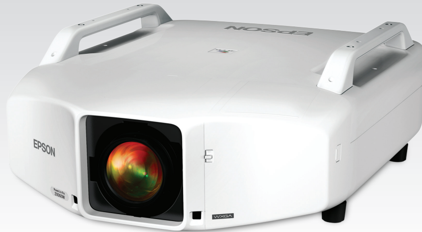
Projector shown with lens. Lens sold separately.