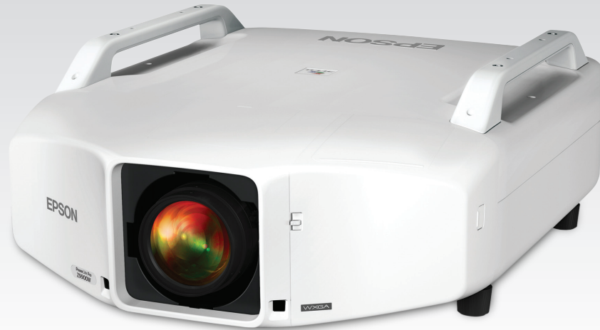
Projector shown with lens. Lens sold separately.