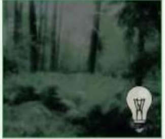
Bright scene ~ 100% power consumption