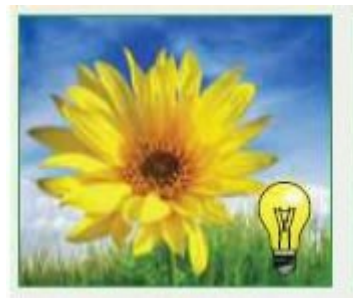
Dynamically adjusts the brightness and power consumption