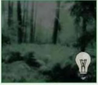
Bright scene ~ 100% power consumption