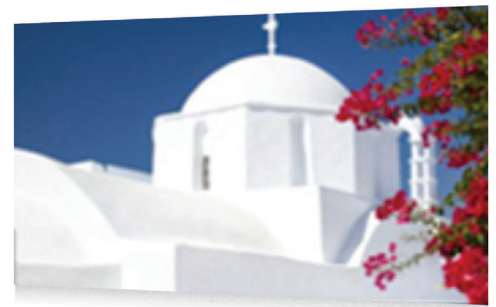
VPL-HW45ES & VPL-HW65ES

Conventional Home Cinema projectors sacrifice some colour accuracy by increasing greens to improve brightness. With Bright Cinema and Bright TV modes, the VPL-HW45ES & VPL-HW65ES retain true colour and contrast, even in a bright environment.