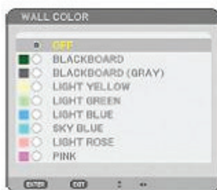
On a green wall...

These provide for adaptive color tone correction to display properly on non-white surfaces.