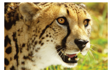
AFTER auto wall correction